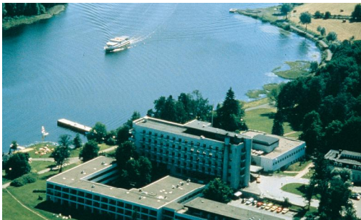
Spa Hotel Rantasipi Aulanko

The conference is a continuation to the FINPIN's University Entrepreneurship-Incubation Processes -conference held year 2006. The forthcoming conference will focus on how universities will promote entrepreneurship by research and education, promoting activities, and transferring best practices.